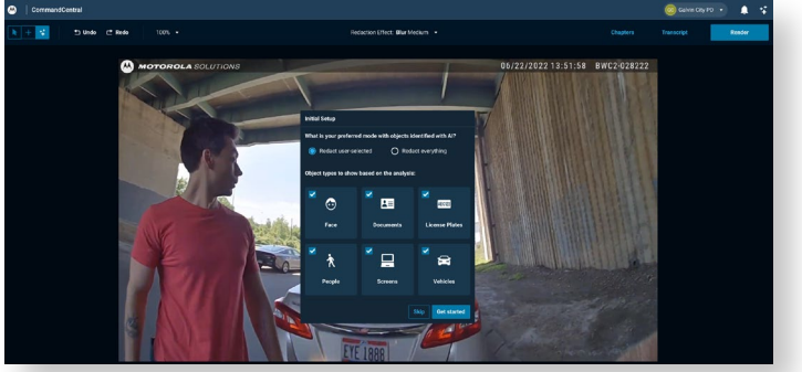
Evidence technicians can easily protect privacy with automated object tracking and redaction.